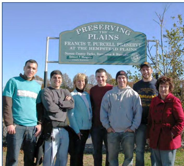
Friends of Hempstead Plains