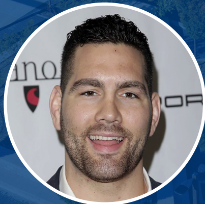
Chris Weidman Former UFC Middleweight Champion